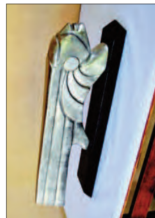
2014 "Road Warrior" by Rollie Grandbois

Camp Ocean Pines 1473 Randall Drive, Cambria, California, 93428